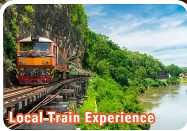
Local Train Experience