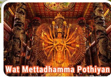
Wat Mettadhamma Pothiyan