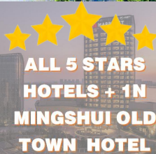
ALL 5 STARS HOTELS + 1N MINGSHUI OLD TOWN HOTEL