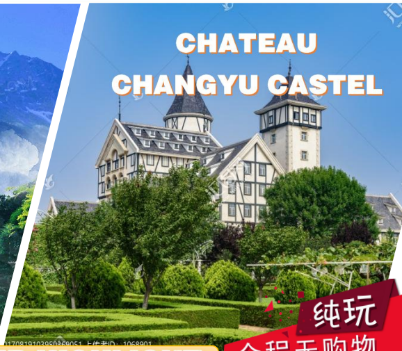
CHATEAU CHANGYU CASTEL