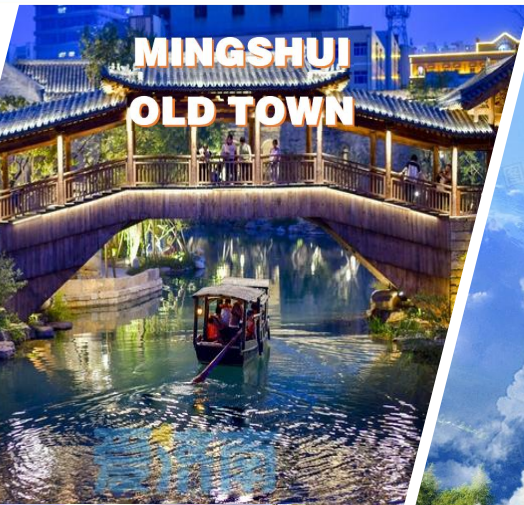
MINGSHUI OLD TOWN